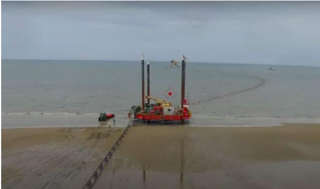
Plate 3.7: Example intermediate pulling platform barge

3.14.5.7 The offshore export cables would then be floated between the cable lay vessels and the intertidal area using cable floats ( Plate 3.8 ). The cable floats support the cable pull-in and cable catenary until it reaches the cable roller boxes on the beach.