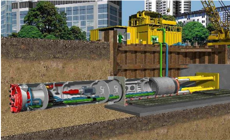
Plate 3.10: Indicative micro-tunnelling schematic

3.15.8.27 Once the tunnel reaches the exit pit/shaft, the MTBM would be removed and the slurry lines withdrawn, leaving the installed concrete sleeve tunnel in situ . Electrical cables would then be installed through the tunnel. Although use installation of a concrete sleeve tunnel is most likely for the River Ribble crossing, various different types of pipe could be used. For example, reinforced concrete pipes, steel pipes, polymer concrete pipes, glass fibre reinforced plastic pipes, vitrified clay pipes or ductile iron pipes.