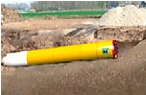
Plate 3.5: MTMB machine at exit location