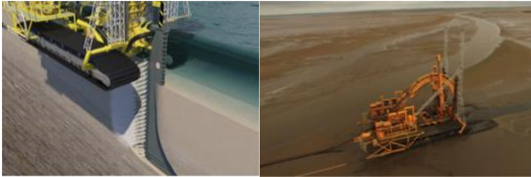
Plate 3.9: Example Cable Trenchers

3.14.5.14 Cable pull-in and burial would take up to six weeks per cable (including mobilisation and de-mobilisation) with cable pull-in and burial works limited to 36 weeks in total on the beach ( Table 3.17 ), spread across a 36 month construction period. This allows for the direct pipe to be installed prior to pulling-in the offshore export cable as well as the limited cable pull-in works during the wintering period (CoT110, Table 3.2 ) to minimise impacts to over-wintering birds who may forage in the intertidal area.