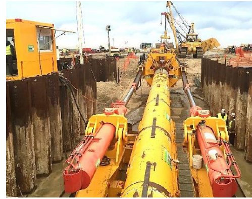
Plate 3.4: Direct pipe thruster equipment at the landfall compound