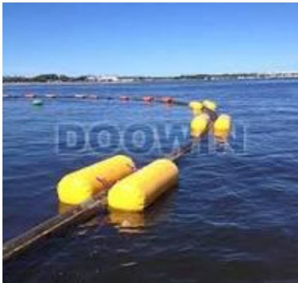
Plate 3.8: Typical Cable Floats

3.14.5.7 The offshore export cables would then be floated between the cable lay vessels and the intertidal area using cable floats ( Plate 3.8 ). The cable floats support the cable pull-in and cable catenary until it reaches the cable roller boxes on the beach.